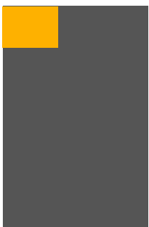
2 col x 3" W 3.333" X L 3"