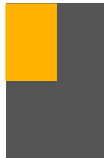
Quarter Page W 5.083" X L 7"