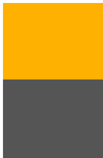
Half Page horiz. W 10.333" X L 7"