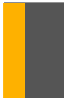
2 col x full W 3.333" X L 14"