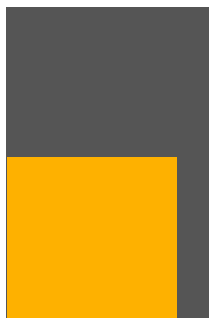
5 col x 7" W 8.583" X L 7"