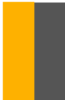
Half Page vertical W 5.083" X L 14"