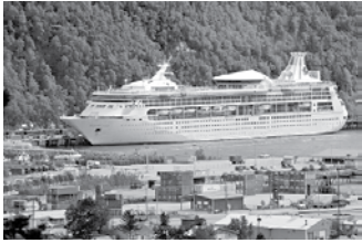
A cruise ship docked in the Port of Skagway in May 2009.