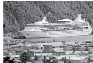
A cruise ship docked in the Port of Skagway in May 2009.