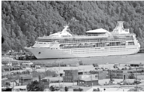
A cruise ship docked in the Port of Skagway in May 2009.

Most security and intelligence work will be a joint effort, including a new system to track when people enter and exit each